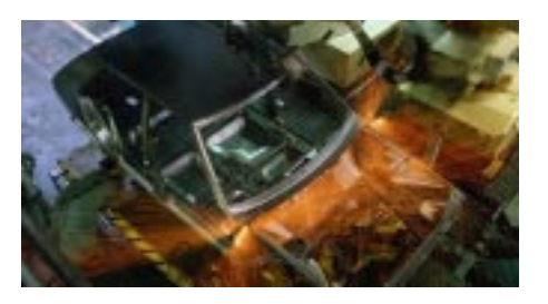
GEMTEK® products are suitable for manufacturing facilities.

enzymes and other fractions derived from soy, corn, palm kernel, peanut, walnut, safflower, sunflower, Canola, cotton seed and jojoba. The SAFE CARE® aqueous cleaners are among the most versatile and powerful surfactant systems in the industry today. These surfactants when placed in water form extremely powerful colloidal micelle solutions. Long-chain hydrocarbon soils such as fats, greases,