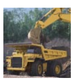
GEMTEK® products may be used for heavy duty equipment.

SAFE LUBE™ metalworking fluids replace the need to use traditional chlorine, sulfur or