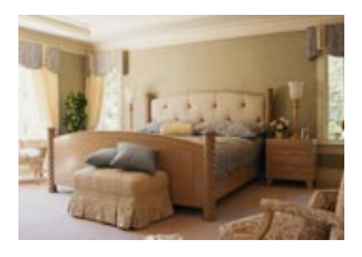
AllerSafe» Anti-Allergen Products provide effective relief from protein allergens while eliminating toxic chemicals from consumer products.

Spray and AS-Anti-Allergen Additive actually neutralize protein allergens on contact. AllerSafe® products do not contain dyes, fragrances or synthetics, which typically cause adverse reactions in people with chemical sensitivities. AllerSafe® products are derived from seed extracts and are completely safe for people, pets and the environment.