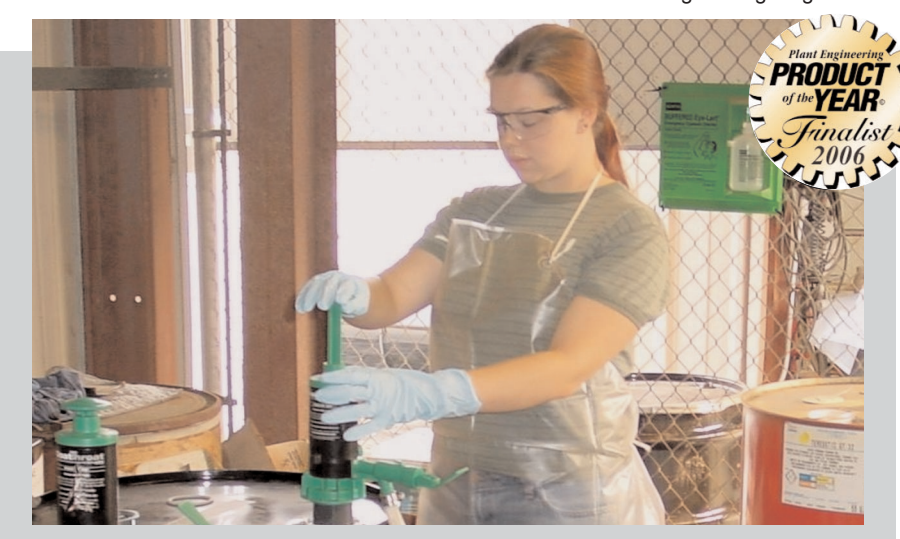
The GoatThroat way Leakproof, spillproof, hand-pressurized for precise one-touch flow control

2006 PUMP PRODUCT OF THE YEAR FINALIST - Plant Engineering Magazine