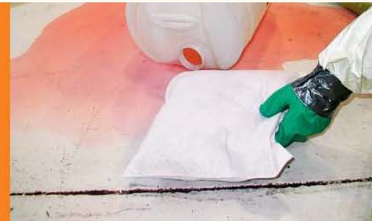
Ideal for Soaking up Larger Spills Concentrated to One Specific Area ▲