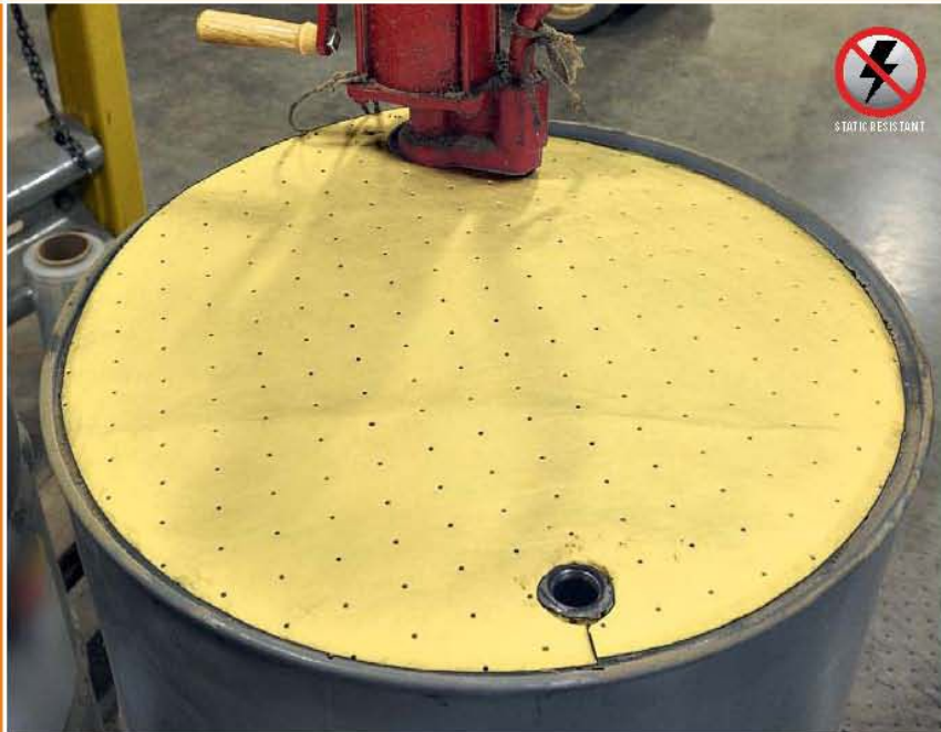
▲ Already Have Pre-Cut Holes in Order to Perfectly Fit on 200 Liter Drums