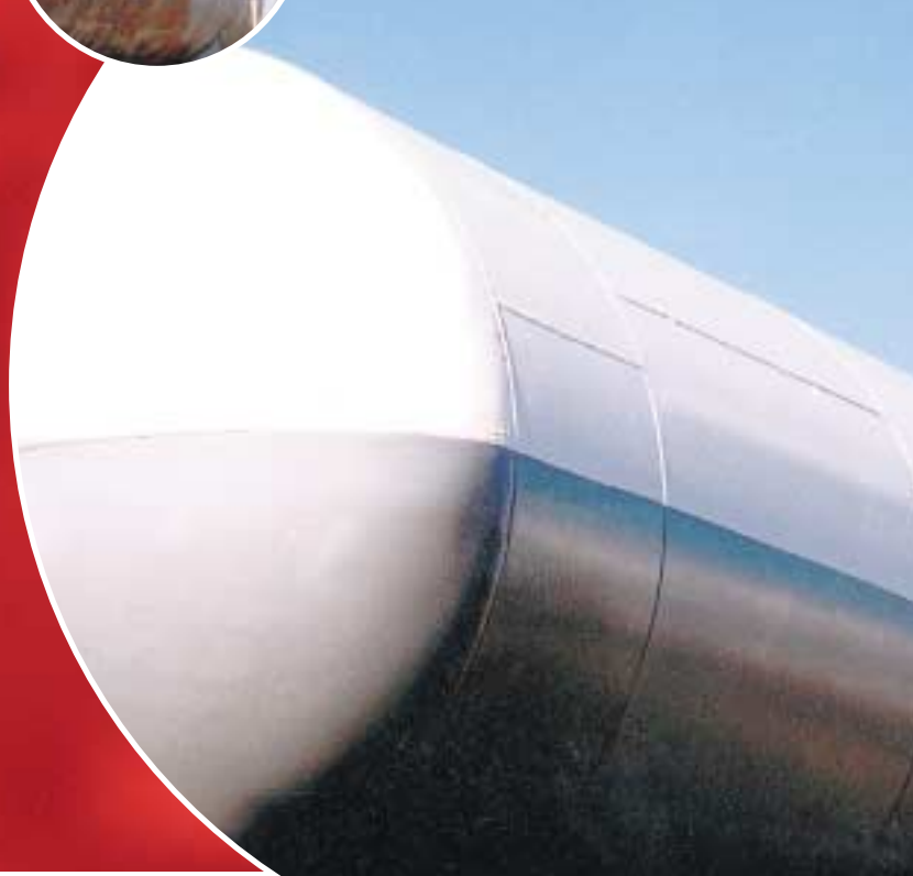
The external surfaces of these gas storage tanks were coated with Corro-Tech GP and Uni-Tech UV, giving long term protection against corrosion and chemical attack.