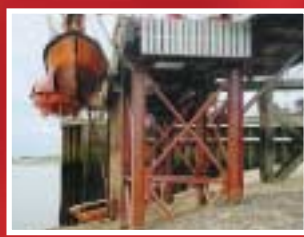
Offshore training rig supports coated with Chemi-Tech UW, a corrosion resistant lining for underwater environments.