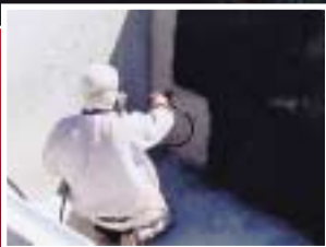
Concrete sewage tanks being lined with Chemi-Tech EP, which provides a total barrier against industrial sewage.