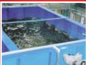
Chemi-Tech CR, a solvent free coating, was used to protect the internal and external metal surfaces of this slurry tank.