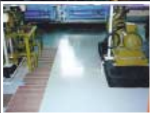
Chemical resistant floor coating, Floor-Tech HB, applied to this floor area to protect it against chemical spillages.