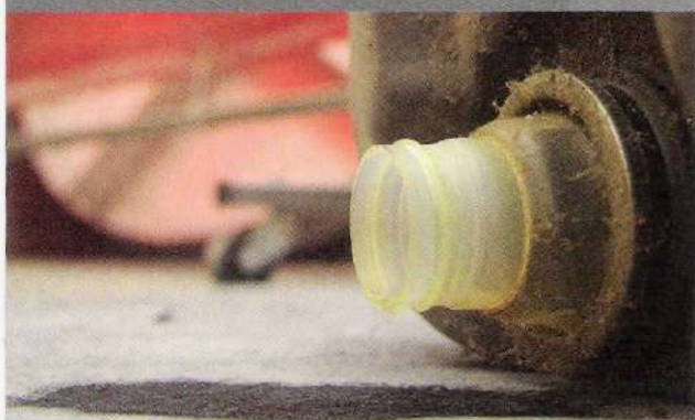
▲ Adsorbs Petroleum Based as well as Water Based Liquids