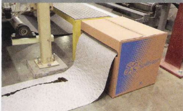
▲ Narrower Rolls are Packed in an Easy-to-Use Dispenser Box