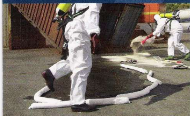
▲ Ideal for Use in Order to Surround and Contain Liquids During a Land Spill