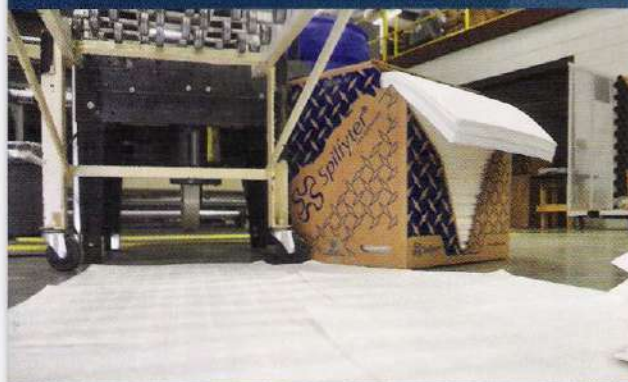
▲ Packed in a Sturdy Dispenser Box for Easy Handling