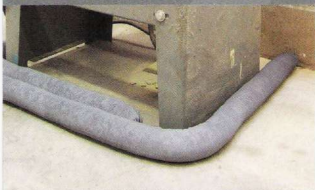
▲ Ideal for Use in Order to Surround and Contain Liquids During a Land Spill